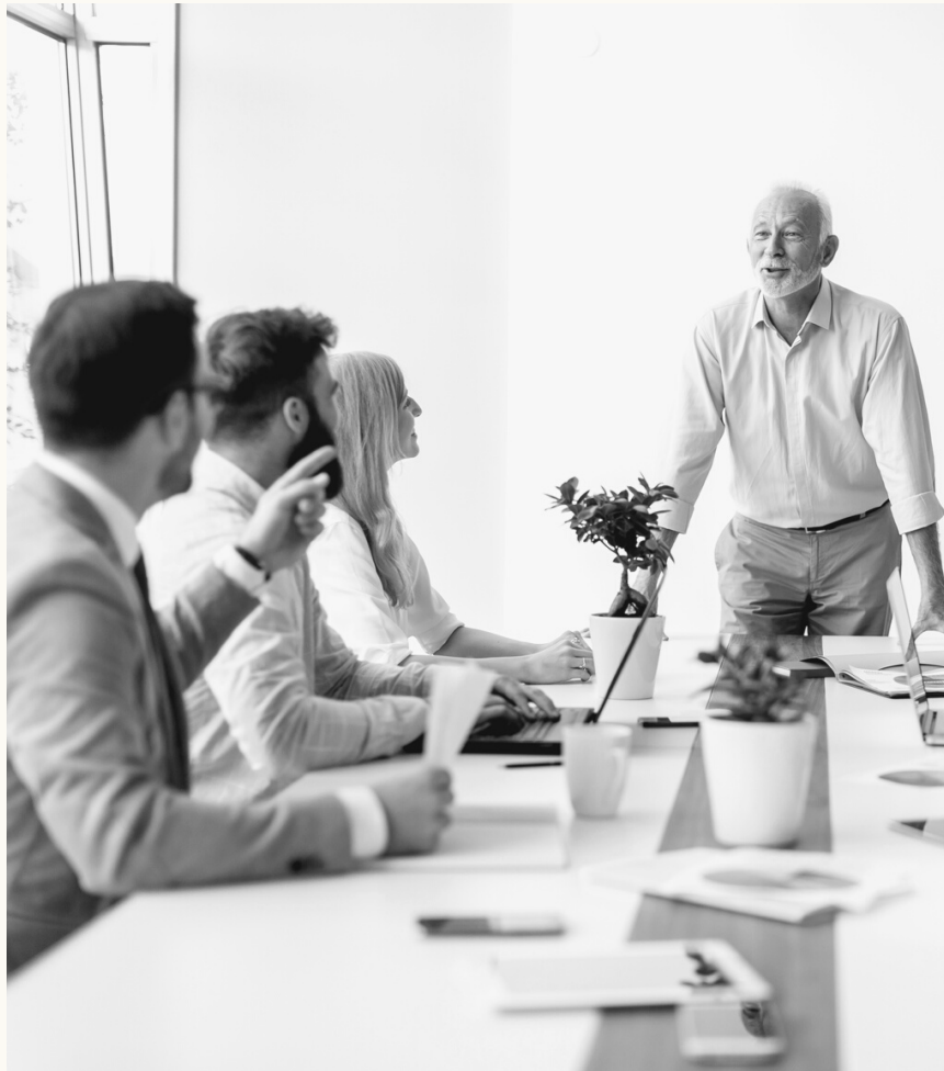
Men empowering women