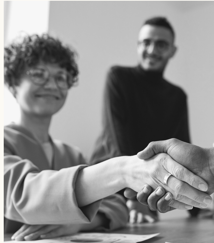
Stand up for women