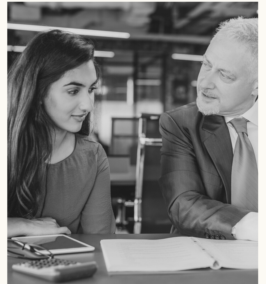
Mentor a women